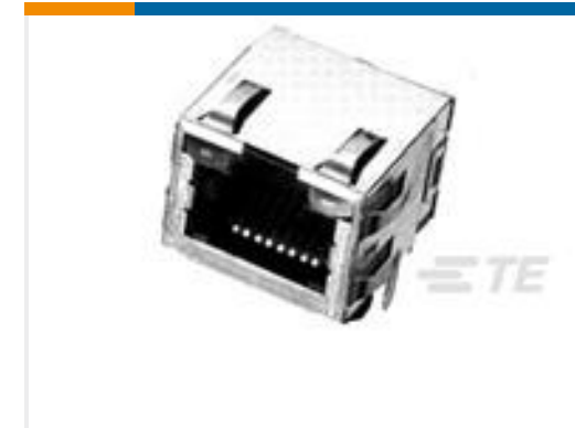
TE Part #1888566-2 IMJ, 1X1, PNL GRD, LED(Y/G), SN