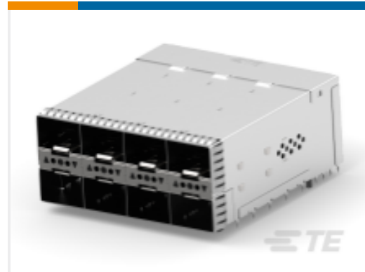
TE Part #3-2180324-2 zSFP+ STACKED 2X4 RECEPTACLE ASSEMBLY