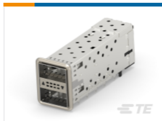
TE Part #2302407-1 QSFP+ ASSY, 2X1, GSKT, 2LP-OUTR, W/ CS GA