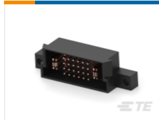
TE Part #1-6600383-9 MBXL VERT HDR 1P+24S+1P STR