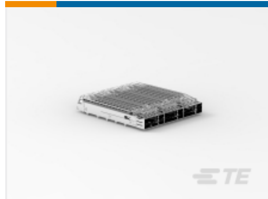
TE Part #4-2170740-1 QSFP28, 1X3, CAGE ASSY, SPRING, HS, LP