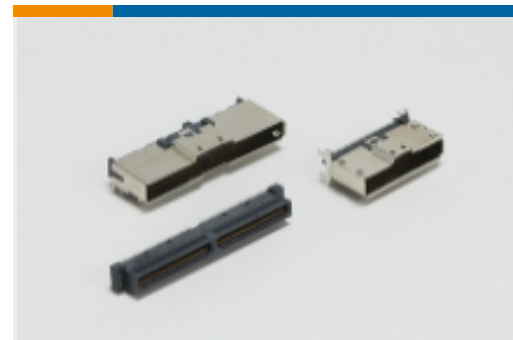
Internal I/O Connectors(133)